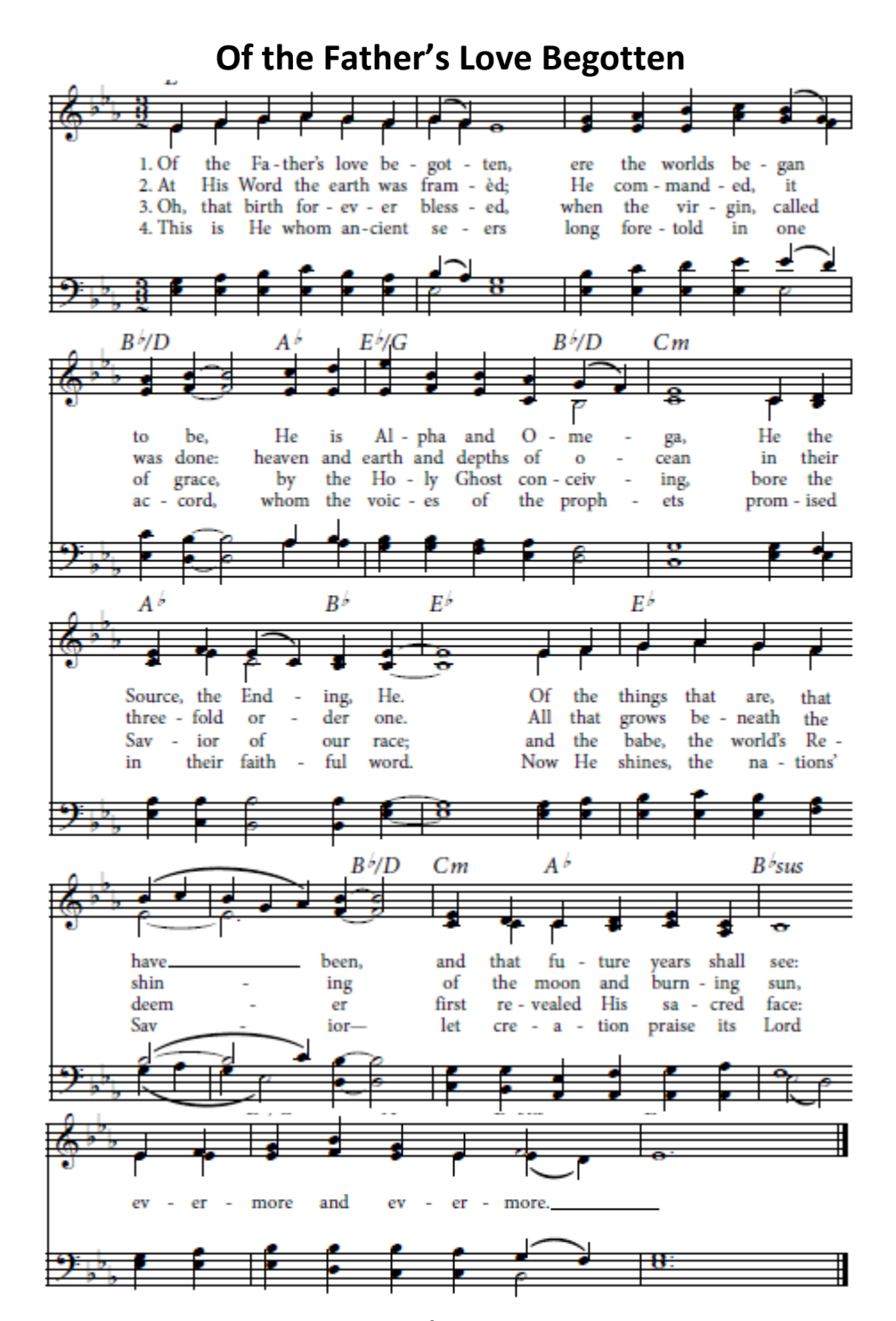
Verses 5 and 6 on next page